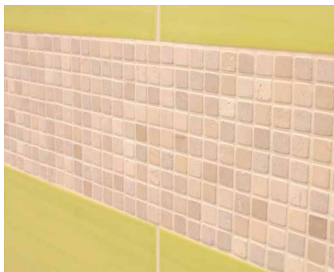
10 Earthenware and natural stone mosaic surfaces grouted with Sopro DF 10®.