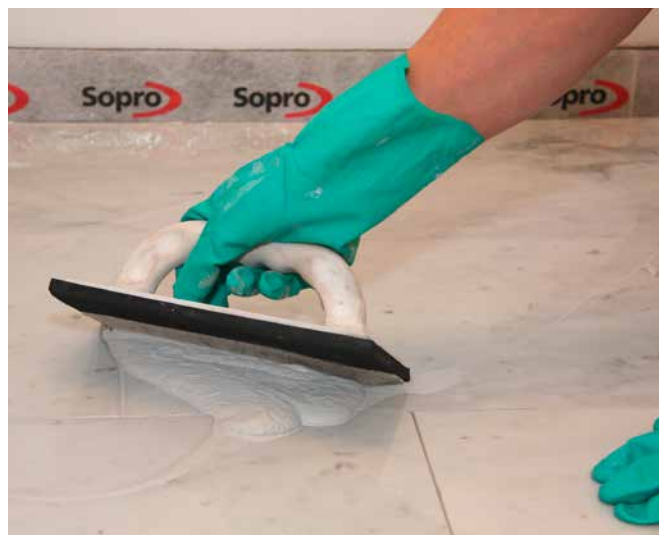
8 Grouting of discoloration-sensitive natural stone with Sopro DF 10®.