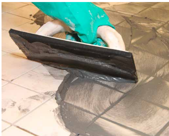
7 Grouting of fully vitrified stoneware tiles with Sopro DF 10®.