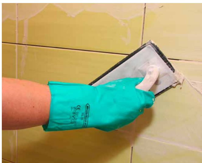
9 Grouting of earthenware tiles with Sopro DF 10®.