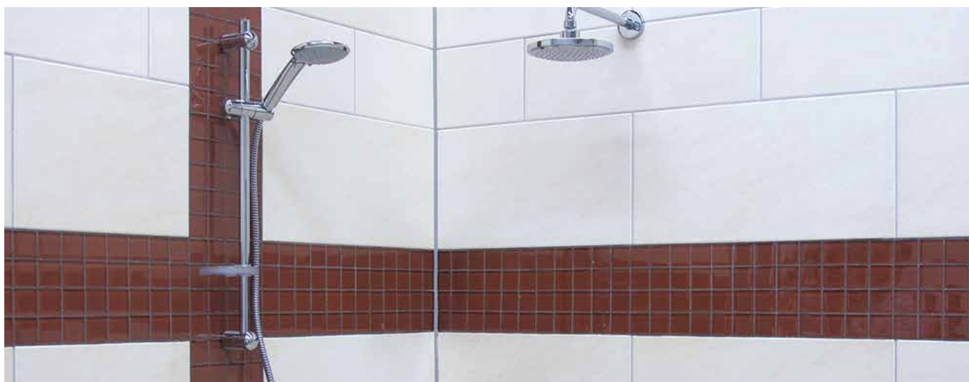
11 Brilliantly coloured joint surfaces in bathroom.