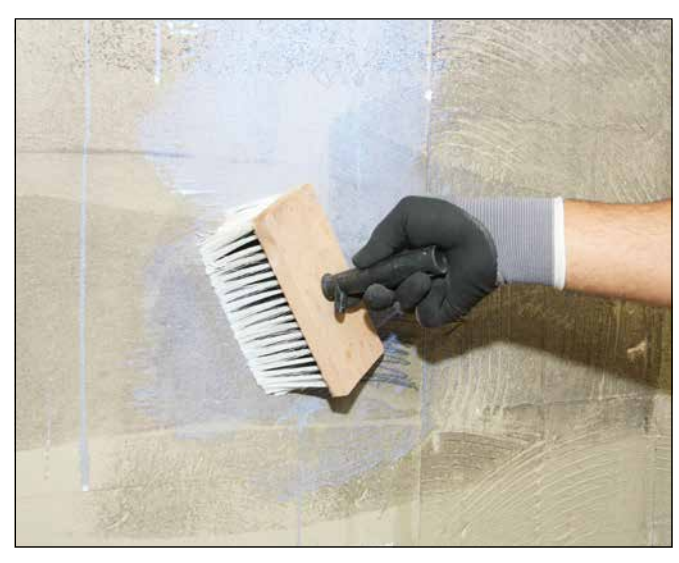
2 Pretreat high- or variable-suction substrates with Sopro GD 749 primer.