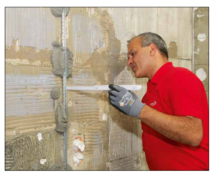
6\ \dots and embed rails at suitable distance from wall, depending on required render thickness, align and allow mortar to set.