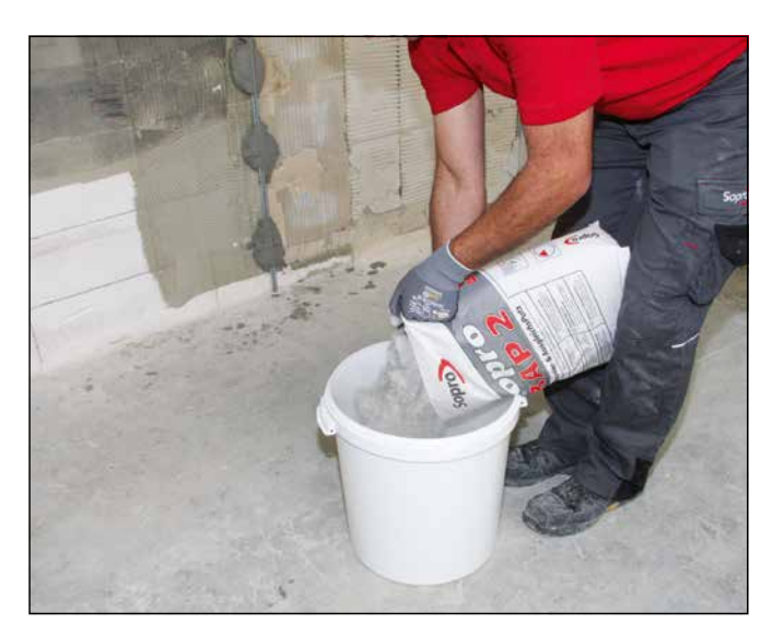
? Pour water into clean mixing bucket and then add powder.