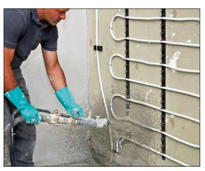
Spray application of Sopro RAP 2 434 is also possible for larger areas, as in pictured example, where render is used to embed (Kermi x-net c21) wall heating system.