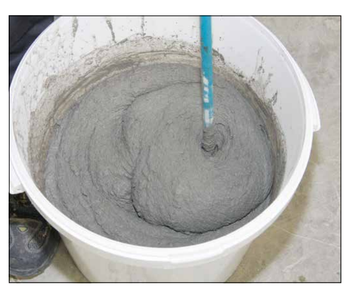
4 Mix Sopro RAP 2 434 mechanically to lump-free consistency. Remix thoroughly after 3–5 minutes maturing time.