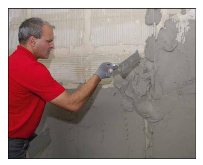
7 Fill area between guide rails by throwing on Sopro RAP 2 434 render.