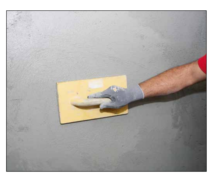
17 ... or a wooden float to achieve an extra-smooth finish.