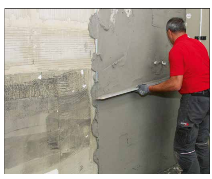
8 Then neatly rule off render by running straightedge over rails from bottom to top.