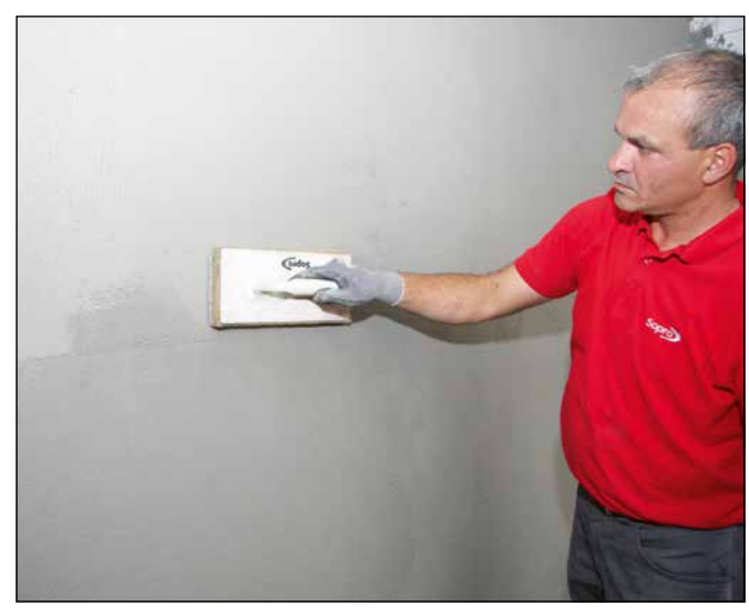
Neatly ruled-off render is ready for tiling after 6 hours. If a tile finish is not required, Sopro RAP 2 434 can be additionally rubbed down with a slightly damp sponge float...