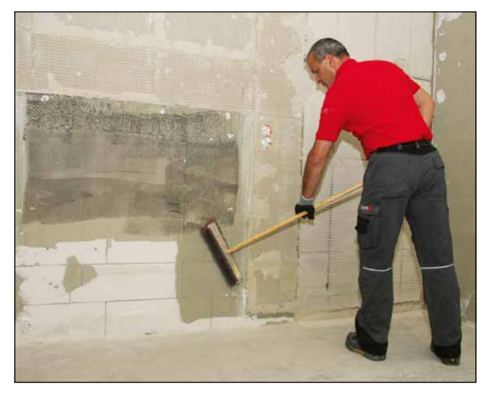
1 Prior to start of works, remove dust and loose particles from substrate.