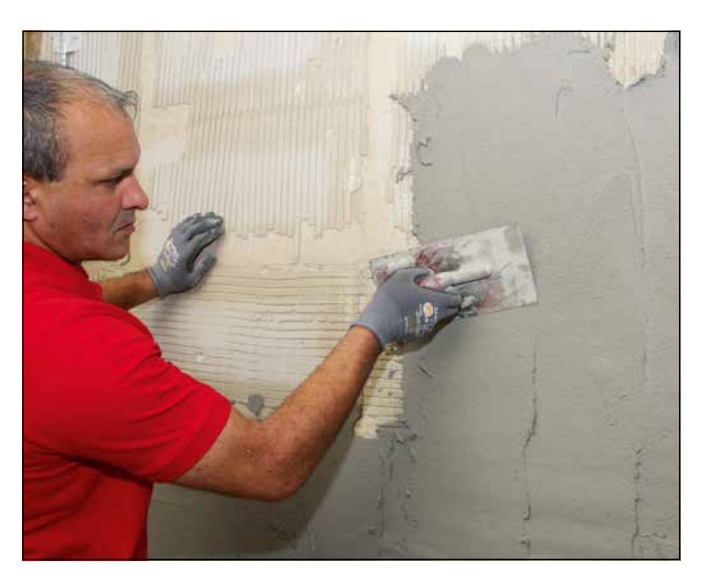
Alternatively, RAP 2 434 can be applied using a finishing trowel.