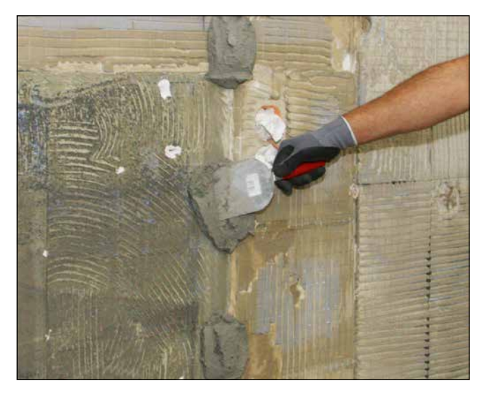
\boldsymbol{5} Fix guide rails for later ruling-off of rendering mortar. Start by applying dabs of render \ldots