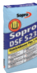
Sopro DSF 523 (W0-I to W2-I only)