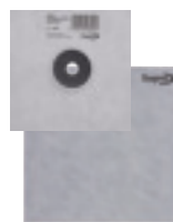
Sopro DMW 090 and Sopro DMB 091