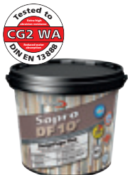
Sopro DF 10