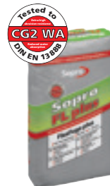
Sopro FL plus