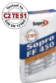
Sopro FF 450