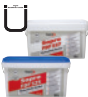
Sopro FDF (W0-I and W-I only)