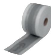
Sopro DB 438