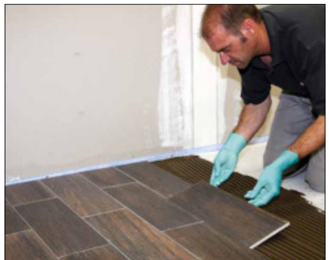
12 Apply Sopro flexible adhesive (e.g. Sopro's No.1 400) and place tiles.