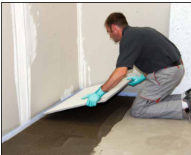
11 To accommodate movement in substrate, subsequent incorporation of Sopro FDP 558 tile insulation board using Sopro flexible adhesive (e.g. Sopro's No.1 400) is strongly recommended.