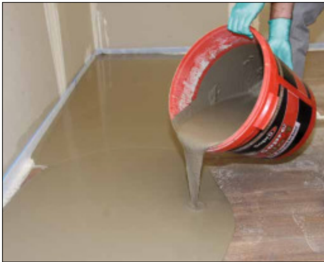
7 ... and pour onto floor.