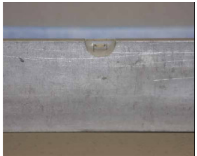
10 Once set, Sopro FAS 551 provides level surface ready to receive floor covering.