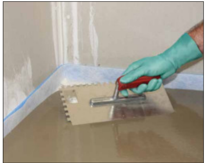
8 Sopro FAS 551 may be spread uniformly using squeegee or finishing trowel.