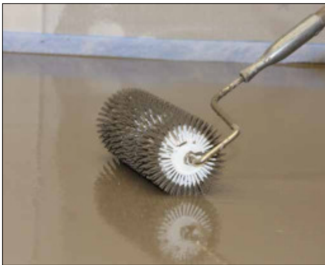
9 A spiked roller may be used to release entrapped air from applied filler compound.